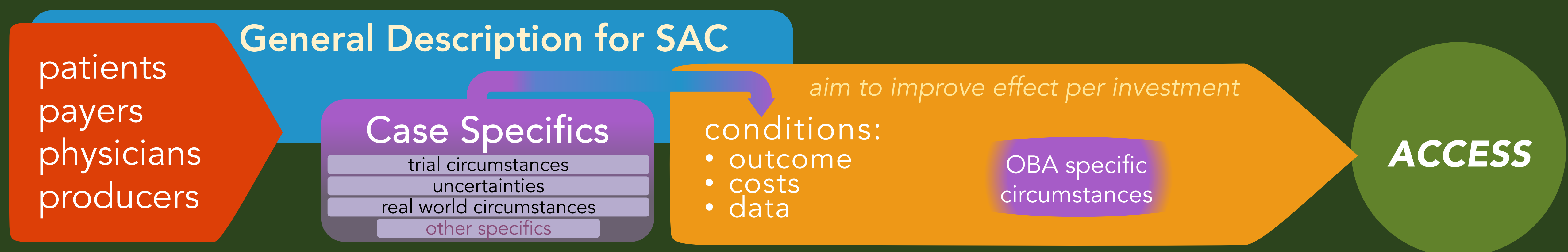
Fig. 1. How agreement on SAC and an OBA can facilitate access to new (expensive) therapies

the industry to have realistic pricing strategies and can help payers to better substantiate their willingness to pay, preparing the way for agreement on the cost element of OBA's.